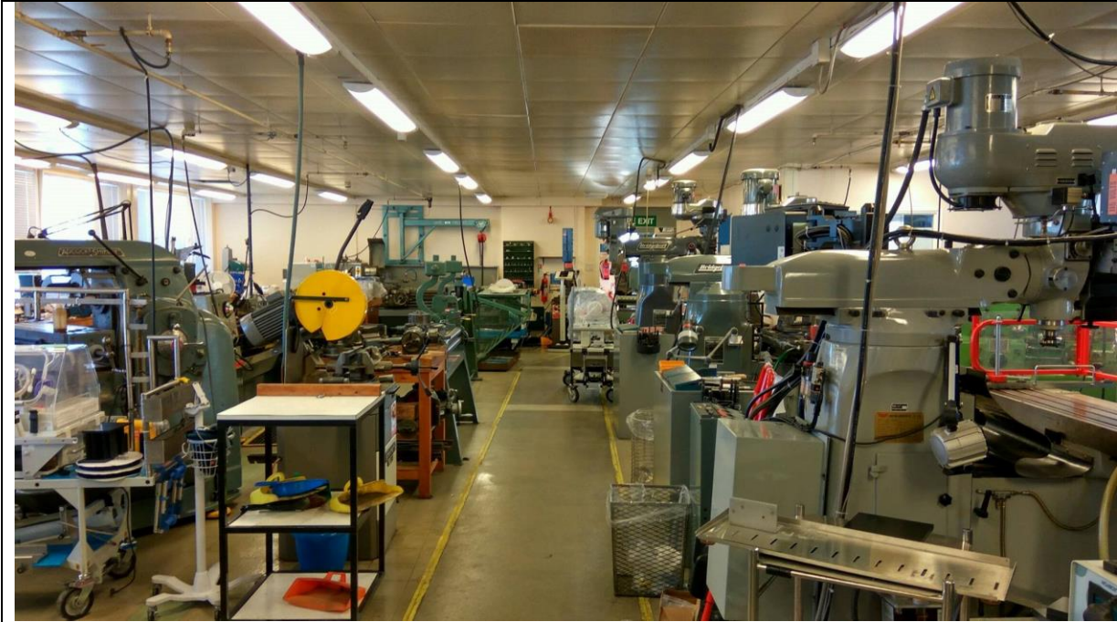
Figure 3. The Mechanical Engineering Workshop at CIG