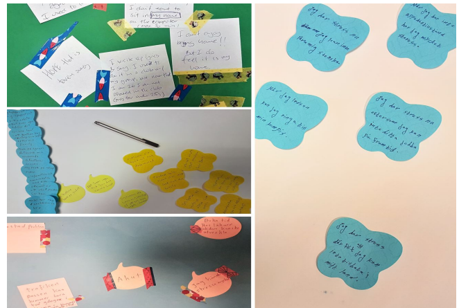
Figure 2. A collection of collages and post-it notes which illustrate the stresses experienced by older participants, in particular.

juggle work and study. In one post-it note, one participant in RgT highlighted: “ it takes a lot of time to work and be at home ” (Figure 3). Whilst this pressure of balancing home and work life is not exclusive to refugees, see e.g. [45, 44, 7, 36], the resettlement process amplifies these pressures because the situation for a resettling refugee is often more precarious, with less resources and less social support to fall back on. Pressures relating to the feeling of not having enough time for everyday, mundane tasks were therefore often described as a barrier to engaging with aspects of the civic turn.