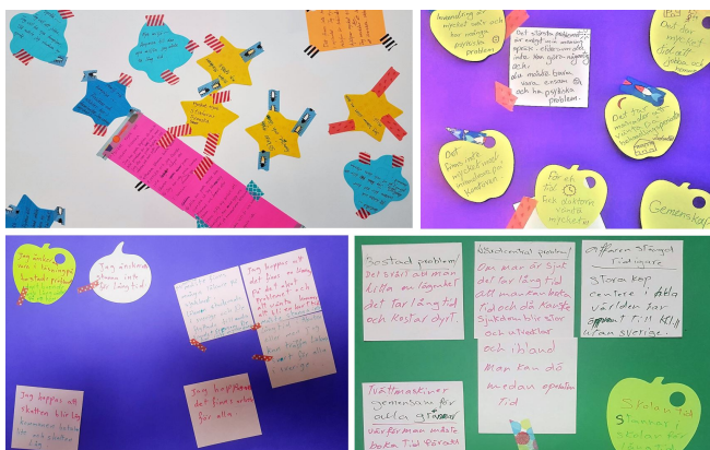
Figure 3. A collection of collages, created by participants in RgM, all pertaining to the barriers experienced when trying to settle in Sweden.

older participants found that age made it harder to learn a foreign language, which was a critical barrier to being able to fully engage with and settle into a new life in Sweden. Contributions from older participants very clearly highlight the difficulty of settling into a new environment. A group of older participants noted: “When I move to this new country I have to learn a new way of life. This is hard” and “I find it hard to fit into the new environment.” Whilst, for younger participants, the motivation to integrate into Swedish society was driven by imagining their future in Sweden, contributions from older participants illustrate a sense of hopelessness: “hope that is taken away” and “I am stressed now because I cannot find a job for the future” Figure 2. The speed at which individuals would turn towards Sweden was thus not linear or straightforward in any simple manner; rather, it comprised complex cultural, social and economic dimensions, which participants noted were not accounted for in digital resettlement services.