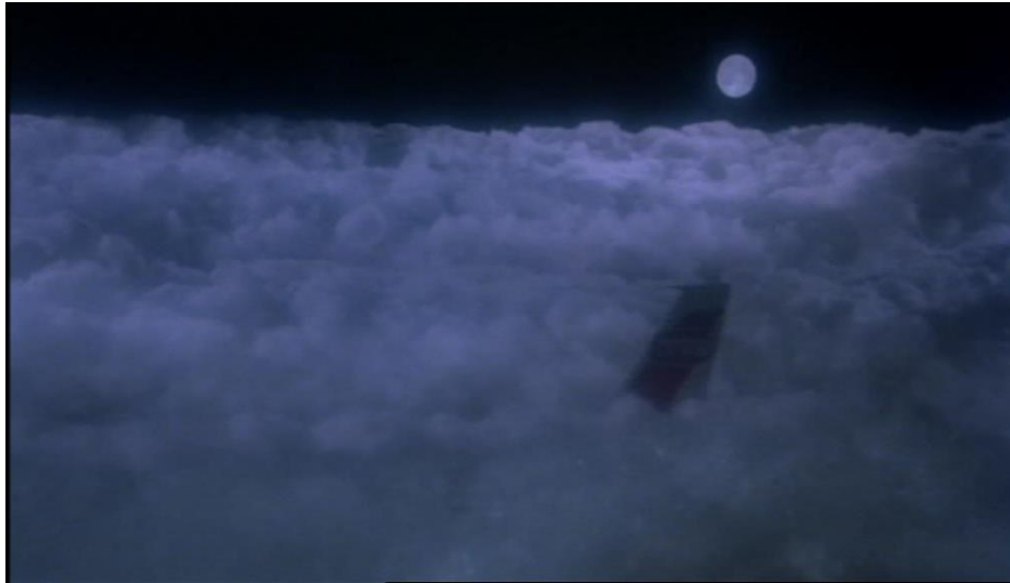
Figure 1: The reference to Jaws that begins Airplane!

The use of music in this way, to establish a point of reference for parody, is a particularly common feature of music in comedies. The animated television series Family Guy (1999–), for example, uses this device frequently and the producers go to great lengths to ensure that the music is accurately replicated from the original source. 10 Though Airplane! does not often directly cite music from other films as ‘musical jokes’ like Family Guy , 11 the Jaws excerpt is representative of the role of music in Airplane! more generally, in that it shows the importance of music in establishing the film’s tone: from the opening scene, this joke demonstrates the film’s parodic nature. In the Jaws excerpt and in the film as a whole, music indicates the sources that are being satirized, whether in the reference to a specific pre-existing film text, or a more genre-based idea of ‘disaster movie’ scoring. Furthermore, the Jaws excerpt is not specifically comedic in any directly musical-semiotic fashion (indeed, it is quite the opposite) – it is the context and setting for the musical excerpt that produces the humorous effect, 12 just as Airplane! ’s score favors allusive musical humor over traditional signifiers of slapstick comedy.