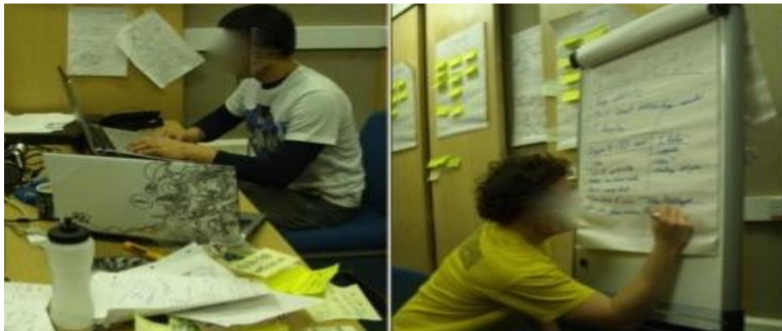
Figure 1. Performing brainstorming in the Country A site (photographic data)

In terms of idea generation, screening and selection , we identified three brainstorming sessions throughout the VT lifespan (15:15-15:45, 17:20-19:00 and 21:30-22:45) and a total of 197 generated ideas across the team.