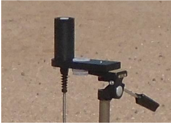
Figure 3: Close-up of diffuser input

GRASS structure (far enough to ensure that it did not affect the GRASS measurements, but close enough to be comparable), and left monitoring for the entire morning. These data were intended to be used partly as validation of the downwelling measurements made using GRASS, and also to provide a representative idea of the variation in solar irradiance over a day.