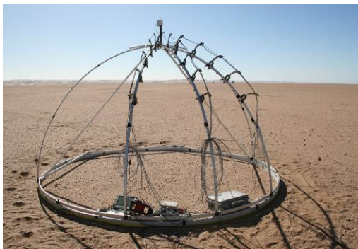
Figure 4: GRASS instrument in situ

Ground-based measurements of the hemispherical directional reflectance factor (HDRF) of the site were carried out with the GRASS [2]. GRASS is designed to record quasi-simultaneous, multi-angle, hyperspectral measurements of the Earth's surface reflectance. Signal collectors mounted on a hemispherical frame and aiming at the same target area are connected with fibre optic cables to a V-SWIR spectroradiometer, operating over a wavelength range from 400 nm to 1700 nm. A full description of the system can be found in [3] and [4].