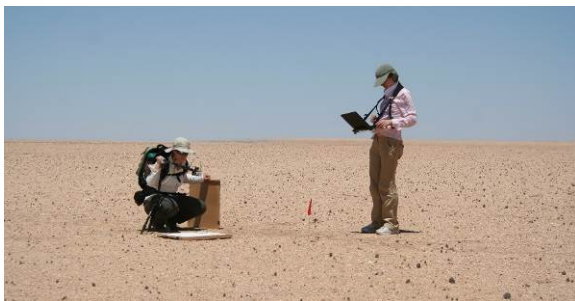
Figure 1: Measurements with the ASD spectrometer

The nadir ground reflectance measurements were performed using ASD FieldSpec portable spectral radiometers. The ASD instrument has good sensitivity over a wavelength range of 400 nm to 2400 nm. It can be used with a bare fibre (with approximately 25° FOV) or with a lens, which has either an 8° FOV (NPL) or 5° FOV (CNES). Measurements taken with the ASD are in radiance units. For traceable reflectance values, measurements of a reference diffuser (Spectralon) are necessary, taken with the same measurement geometry and under the same illumination conditions as the ground measurements.