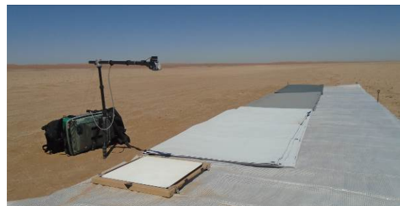
Figure 2: Measurements with tarpaulins

A set of three large, uniform reference tarpaulins was brought to the site. These were manufactured to have Lambertian reflectance properties and three different grey scale levels. They were previously calibrated for total diffuse reflectance and 0°:45° radiance factor at NPL. In the field they were used to provide a large uniform area over which we could perform comparisons of different measurement procedures, and investigate how much effect changing the ASD operator has on the results.