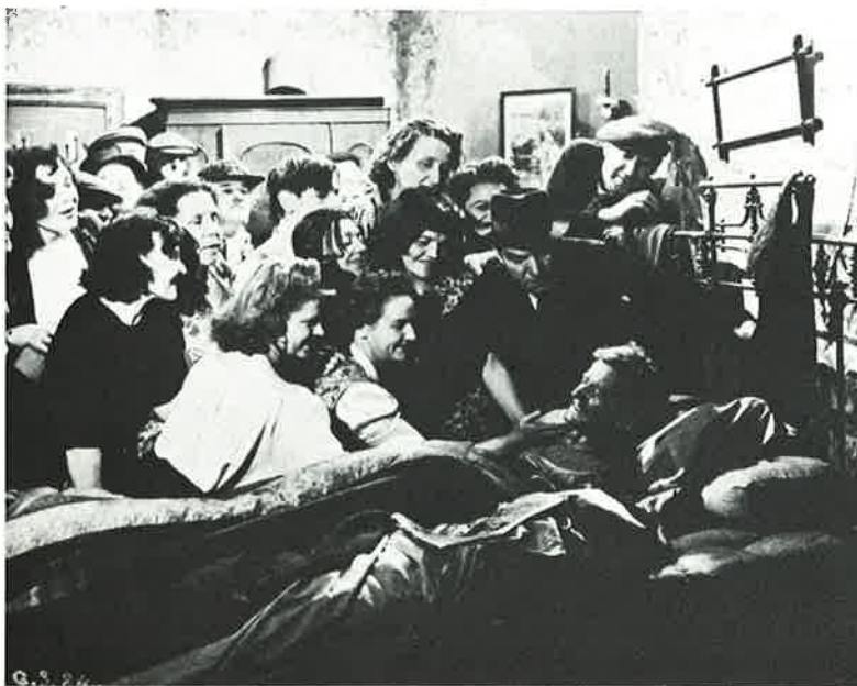
Undermining the privacy of family melodrama: The Gorbals Story

But that said it should nonetheless be recognised that the sphere of domesticity still remains the film's limits. For what seems to disable above all the film's attempt to project the working class on to the screen is the systematic absence of work and politics and a sense of structural as opposed to inter-personal social relations. As has been already noted, while the film initially locates itself in relation to the Clyde, it does so in a way that crucially omits what the other Unity plays and a film like Floodtide made central: shipbuilding and industrial labour. Only two characters in The Gorbals Story are indicated as in any way working (and in the case of Wullie, the emphasis is exactly opposite) and even these are in occupations marginal to the industrial system (baker and usherette). Likewise with politics: while the play addressed itself directly to the post-war housing shortage and the accompanying disillusionment with the promised 'homes fit for heroes', the film chooses to diminish these in a way which makes the housing problem diffuse and unspecific. Thus when a homeless couple appear on the screen in search of