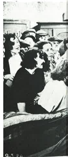
Undermining the privacy

But that said it shows how domesticity still remains a central theme above all the film's attention to the systematic absence of individual characters opposed to inter-personal relationships while the film initially presents a way that crucially opens up the world. Floodtide made central characters in The Gorbals Story (and in the case of Wullie, these are in occupation with a usherette). Likewise with the post-war housing crisis with the promised 'home' these in a way which makes them. Thus when a homele