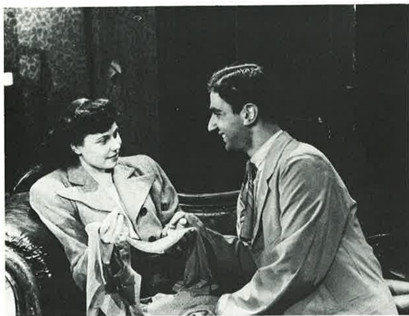
Miscegenation in The Gorbals Story

Two aesthetic strategies enforce this. First is the stylistic emphasis on