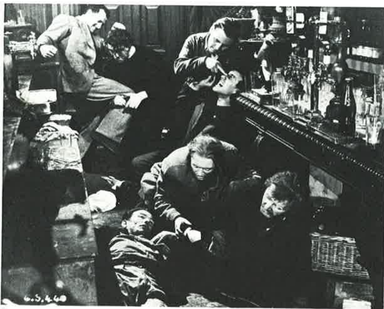
'Demoralising drunkenness and violence': The Gorbals Story

However, there is an important exception to this overall drift. And this is provided by the flashback structure which the film has employed to frame the main drama (and which is an addition to the original play). As noted, the film begins with Johnny in his studio. He has now crossed the river to the West End and become a successful artist. Two