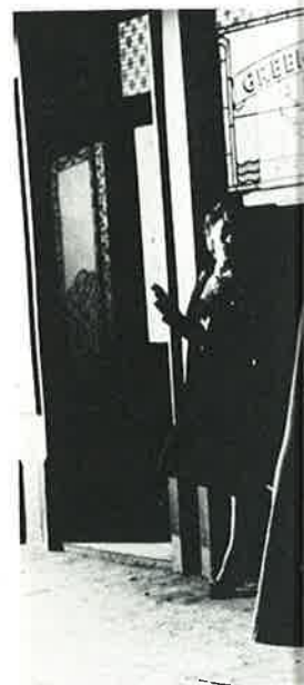
'The Green Tartan' with balanced composition and

enclosure deriving from characters are seen to be them merely that which we hear the voices of characters. The camera then takes up (mainly off screen) but rather by the window through to do with the obvious. At this point then to note is the effect of producing a social. The film's attempted naturalistic de-contextualised nature is particularly pronounced ('The Green Tartan') with a balanced composition and Wullie's own visit to the altogether and two large men drinking. In such a fatal lure which both the possibility of its characters and social and economic re-