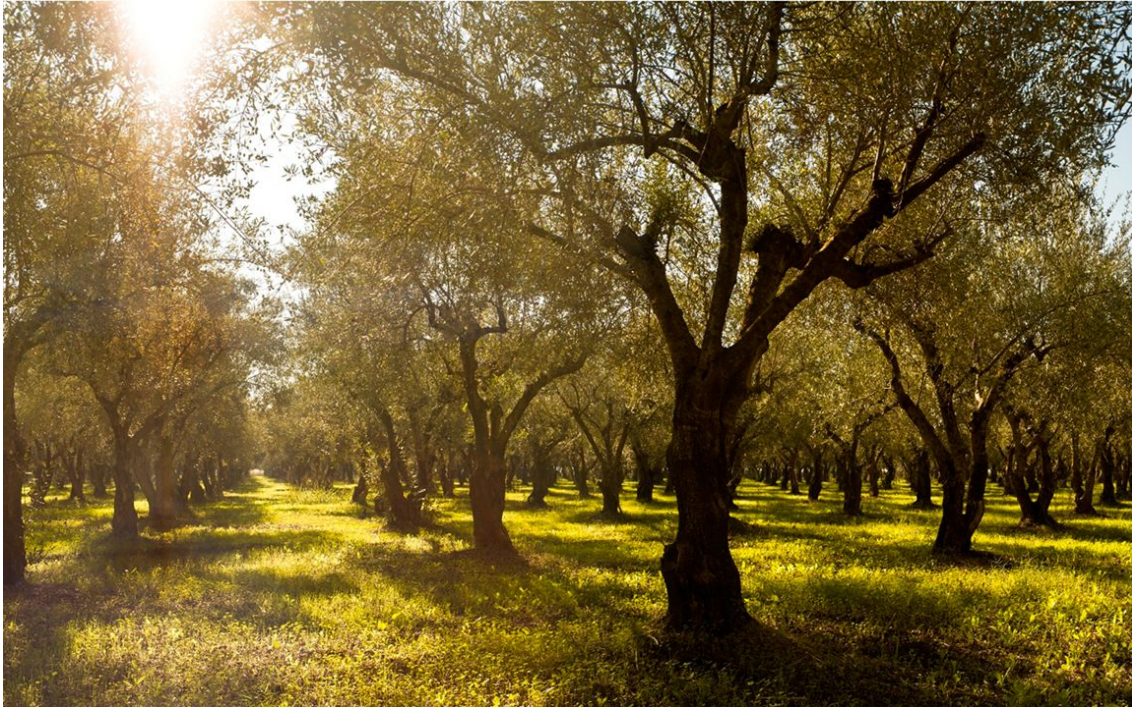
Figure 2. Messinian Olive Grove; image taken from Costa Navarino promotional material.