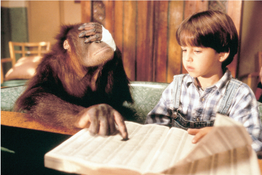
Fig. 4: Dunston Checks In .

Offered a chance to escape, he refuses to leave his cage until he can put on his clothes. ‘I’m not dressed’, he says to the waiting chimps, one of whom replies, ‘But Thelonius, you’re an orangutan’. He repeats, simply, ‘I’m not dressed’. At the film’s end, the animals are all safely ensconced at Farmer Hoggett’s rural haven, but whereas the other apes take easily to the trees, Thelonius insists on staying in the house with the humans. Because the narrative is constructed from a zoo-centric perspective, the viewer can read past the anthropomorphism by which Thelonius’s character is realised to register the finale as not only a critique of his (enforced) acculturation to human ways but also a suggestion that he has now chosen how to live amid limited options.