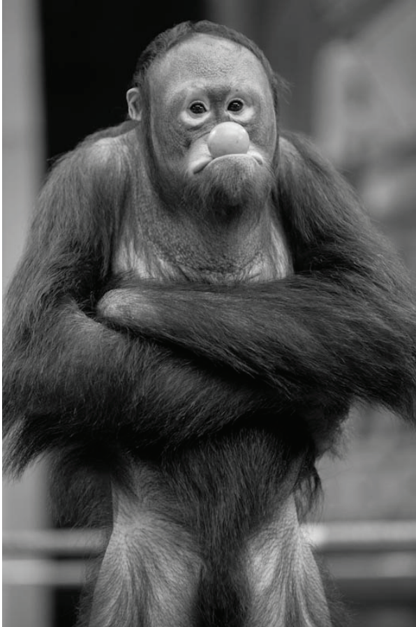
Fig. 1: The Disappearing Orange Trick.

'I'm not looking for trouble as men are ... I like acting. It is so easy to amuse idle people.' (Hornaday 62)