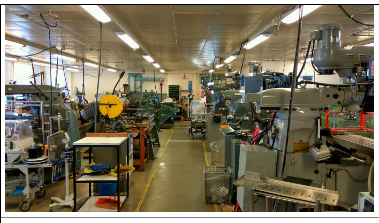
Figure 3. The Mechanical Engineering Workshop at CIG