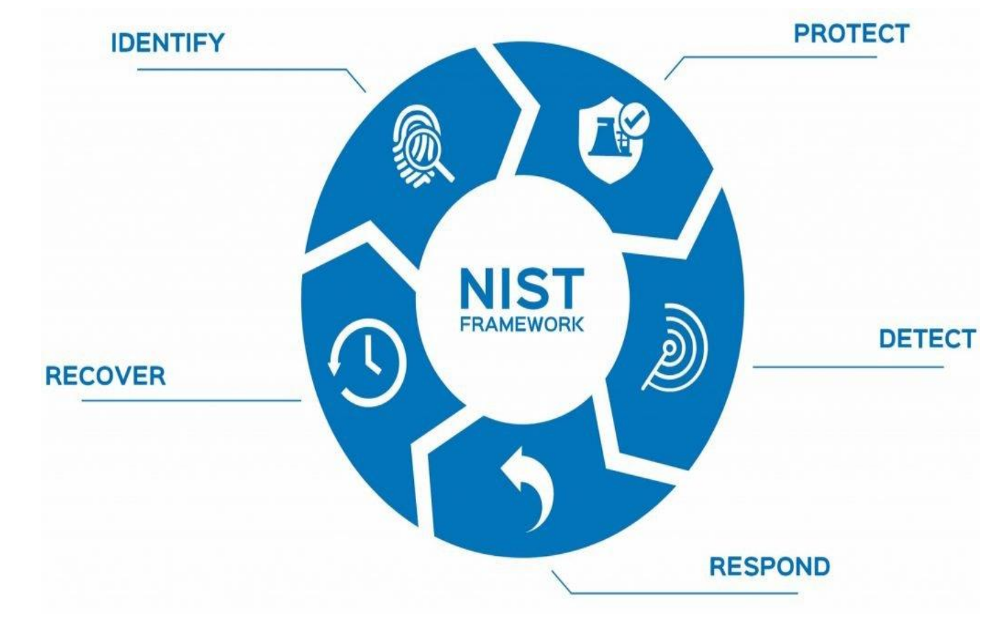
Figure 2: NIST cyber security framework