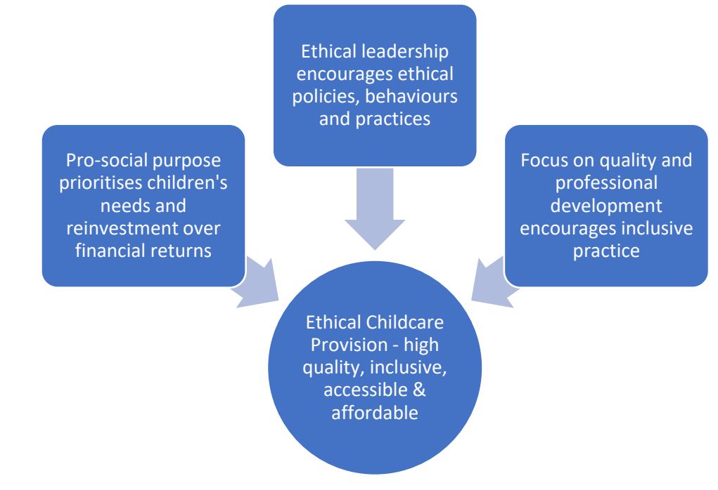
Figure 3 Meso influences on ethical childcare practice