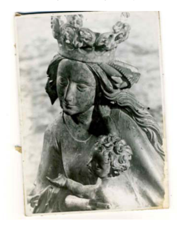
Fig. 3: Wooden sculpture of Virgin Mary with child, from the workshop Syrlin or Erhart around 1510. Only photograph of art work from the art collection Felix Ganz. Cf. Lostart.de object ID 590487.

The claim of Felix Ganz' daughter Annemarie Kaulla is the only document providing details of the art collection and therefore an important source for its reconstruction. <sup>15</sup> Even if the description is vague it gives an idea of the quality and volume of the collection, including the holdings of objects from East Asia: