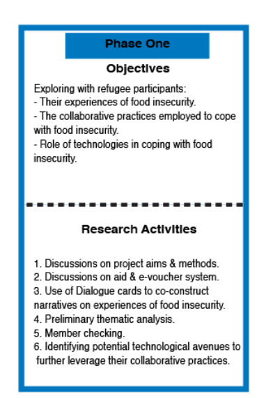
Fig. 2. Detailing Phase One study objectives and activities

3.2.1 Phase One. Herein, we adopted dialogical methods that accounted for the research context, research sensitivity and literacy levels of participants. The varying literacies of participants entailed the need to provide participants with methods that rely on imagery versus written methods of data collection. The adoption of dialogical methods enabled the participation of participants of varying literacies, the creation of a safe space for both participants and the researcher and allowed for the construction of shared narratives. Furthermore, methods were selected based on discussions between the lead researcher and refugee participants (see phase one, activity one). For a detailed account of the methodological motivations and the value of adopting dialogical methods please refer to Talhouk et al. [62] where we have presented how the methods were developed and grounded in the researchers' and participants' contexts and research objectives.