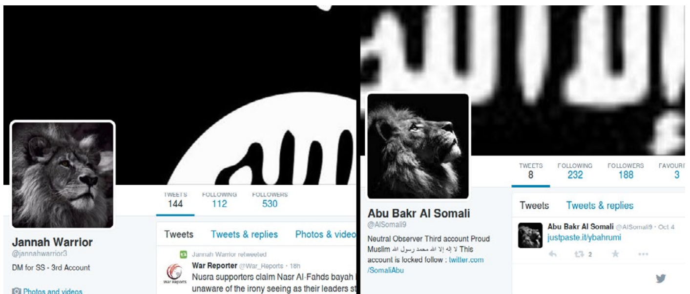
Figure 2. An illustrative example from our data of two accounts which we did not classify as duplicates of one another, despite some similarities. Screenshots of two user accounts taken from http://twitter.com .