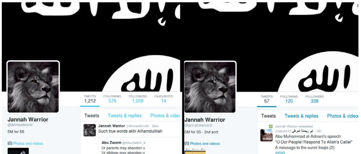
Figure 1. An illustrative example from our data of two resurgent accounts which we classified as a set. They have almost identical handles and almost identical biographies. Their images were not inspected, but their profile images are an almost identical match too. Screenshots of two user accounts taken from http://twitter.com .

When comparing accounts, we used open criteria for determining whether they formed a set. However, in practically all cases, an almost identical match between handle, name, biography or location was necessary and sufficient. Biography and handle were the strongest indicators, whilst location, surprisingly, was still informative due to peoples' unique spelling, punctuation, and choice of descriptive terms. A hypothetical, illustrative example of an almost identical match would be the handles “@jihad_bob2” and “@jihad_bob3”.