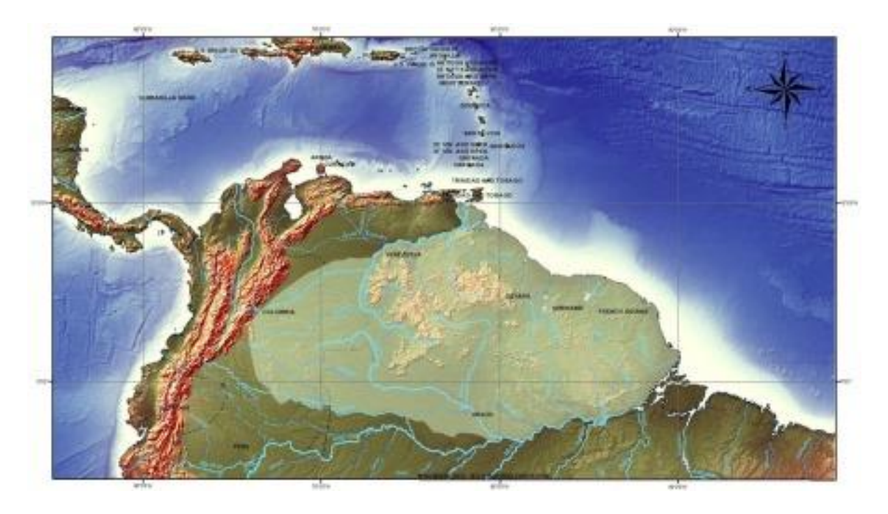
Fig. 2. Figure 2. Map of the Guiana Shield, South America (kindly drawn by Sarvision 2014)