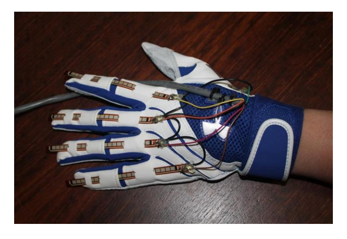
Fig. 2 Motion sensor glove used to record motor overflow.

An individually made thermo-plastic splint was worn by participants on the active dominant hand during scanning to isolate movement in the digits. A custom built four-finger motion sensor glove (Mag Design & Engineering, California) with flex sensors along each digit (see Fig. 2) was worn by participants on their non-dominant inactive hand to record any displacement of digits during performance of functional tasks (sampling rate 100Hz).