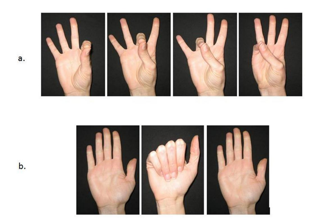
Fig. 1 Images displayed for the finger sequencing (a.) and hand clenching (b.) tasks

Participants completed two active tasks on their dominant right hand. The first was a sequential finger sequencing task which involved participants touching each finger onto their thumb one at a time (Figure 1a). Children with DCD have been shown to present with abundant contralateral motor overflow on this task (Licari et al. 2006; Licari and Larkin 2008) and it is a task easily adapted to the scanning environment. The second task was a repetitive hand clenching task which involved participants opening and closing their hand (Figure 1b). This task was selected because it involved movement of the same digits and activated similar cortical regions during piloting. Children with DCD were also assessed performing this task prior to scanning and minimal contralateral motor overflow was observed, making it a suitable contrast task for this study.