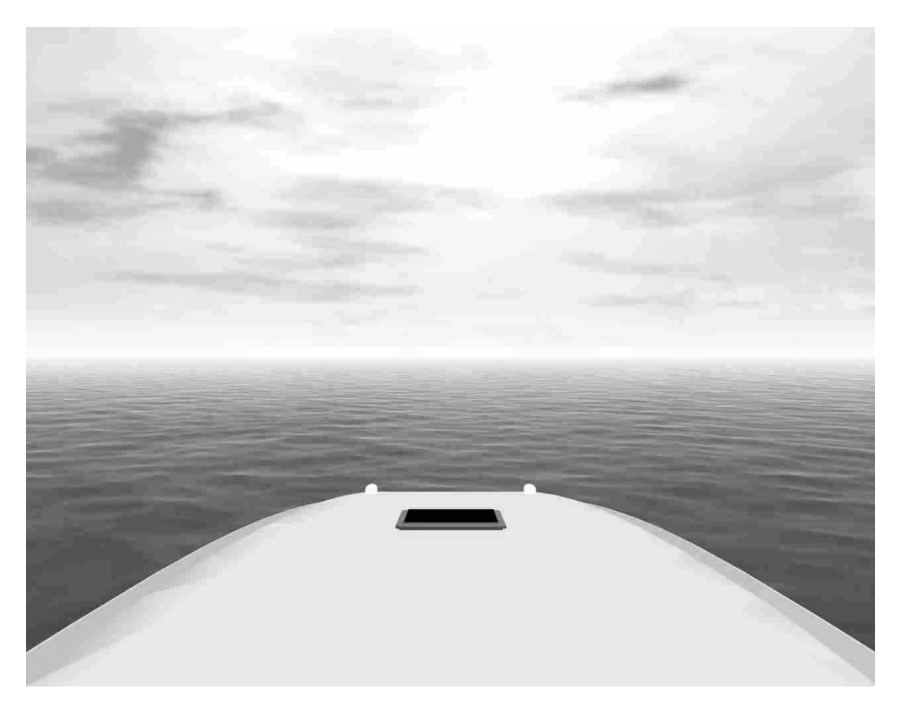
Figure 1. Example display image from the task. Image has been converted to grayscale for publication.