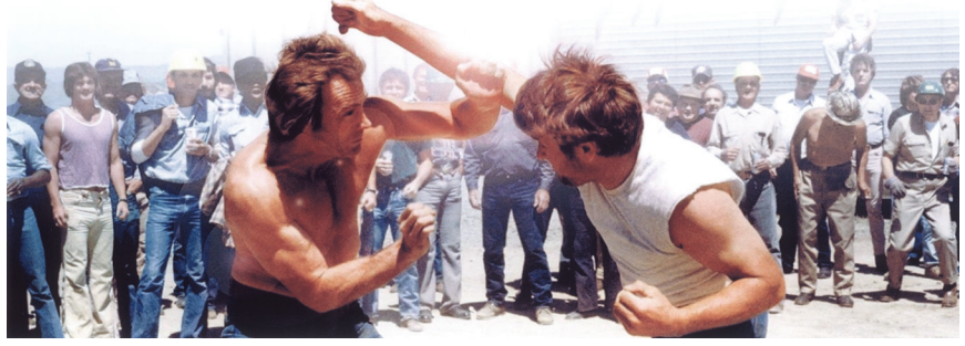
Fig. 2: Every Which Way But Loose.

species equivalence can only ever be provisional since their comedy inheres in an emphasis on the imperfect symmetry between ape and human. A roadside scene in the second film, for example, is played for laughs as Clyde stands with Beddoe and a friend to urinate while the camera lingers on their naked male backsides, all lined up in a slightly odd row. When Clyde goes to the zoo for a rendezvous with his 'girl', Bonnie, so he can share his human friends' carnal pleasures, the running visual discourse of species likeness with a critical touch of difference also extends to (male) sexuality.