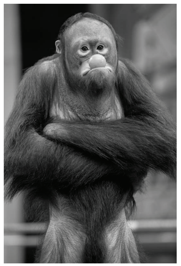
Fig. 1: The Disappearing Orange Trick.

'I'm not looking for trouble as men are ... I like acting. It is so easy to amuse idle people.' (Hornaday 62)