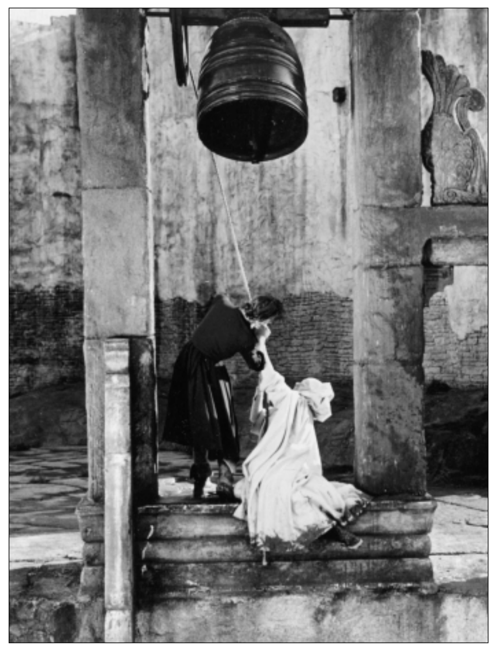
• Black Narcissus: Calling the imperialist civilising mission into question.

intellectual superiority and in ensuring that Indian subjects would work for, and not against, their imperial masters. While the value of