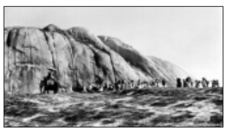
• A Passage to India (Lean, 1984)

Anne Beezer also suggests that while irony may take on the guise of 'an analytical, "deconstructive" mode' in the way in which it deflates the pretensions and high-mindedness of heroic imperial discourses, it is also typically 'conservative in its operations', implying that 'if a long enough view is taken, all current events and individual dramas are insignificant in the face of the "immensity of life"'.23 It is also this sense of the transience of human actions in the face of the 'immensity of life' that underpins the film's deployment of irony and hysteria in response to the ultimate 'unknowability' of India. For Said, a key feature of orientalism is not simply its construction of the East as 'absolutely different' but as 'unchanging'.<sup>24</sup> In Black Narcissus this