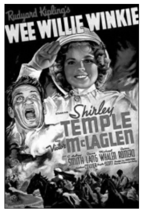
• Hollywood orientalism?: Wee Willie Winkie (1937).

traditional and the technological, the Tory and the pagan'.<sup>4</sup> Nevertheless, it is to make the point that, for all its formal exuberance and selfconsciousness, the cinema of Powell and Pressburger does tend to draw upon and elaborate relatively conservative discourses of identity and place that is evident, for example, in the portrait of Englishness in A Canterbury Tale (1944) or the imagining of Scotland in I Know Where I'm Going (1945). It is also an issue that arises in relation to any consideration of Black Narcissus. For while the film is set in India and was released in 1947, the year India was finally granted independence, there has been relatively little discussion amongst writers on Powell and Pressburger of the film's representation of India or assessment of the significance of this. On the other hand, writers with an interest in orientalism and the cinematic portrait of India have tended to downplay the importance of the film's authorship and have simply identified the film in terms of ongoing patterns of orientalist imagery. Thus, in Ella Shohat and Robert Stam's